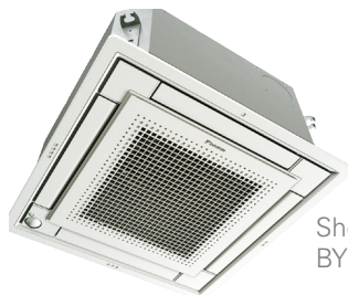
Shown with panel BYFQ60C2W1W