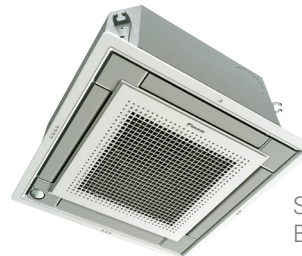
Shown with panel BYFQ60C2W1S