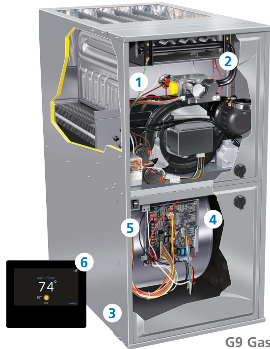
G9 Gas Furnace

Airquest gas furnaces are designed for durability and comfort. The warmth and efficiency of natural gas combined with a quiet, efficient blower motor delivers comfort throughout the cold seasons. The gas furnace can also be combined with an indoor evaporator coil and properly matched outdoor air conditioner or heat pump to provide cooling during the warm seasons.